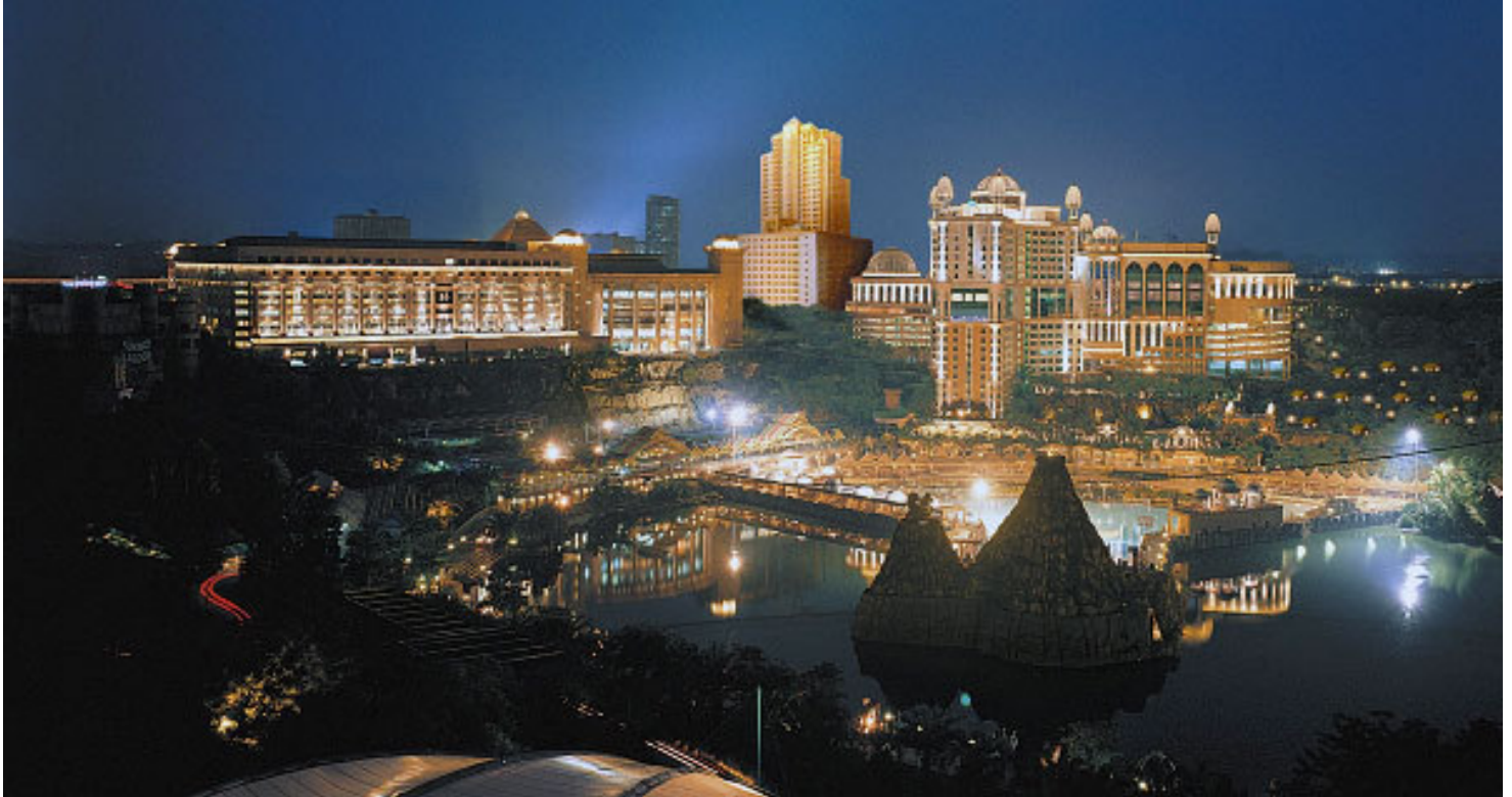
Sunway Lagoon Resort Hotel & Spa Overview

The Official Hotel – Sunway Lagoon Resort Hotel & Spa & Sunway Pyramid Tower