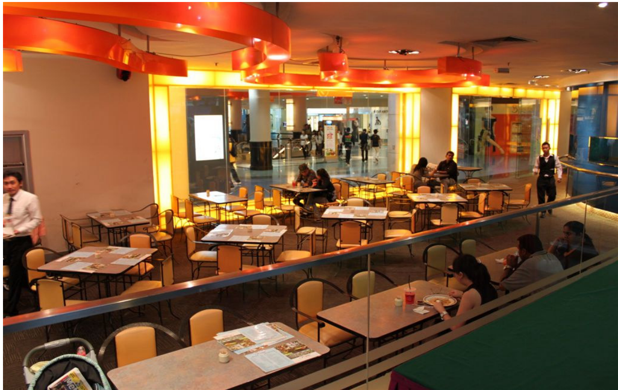
Cafe Area inside Sunway Megalanes

February 19-26. Sunway Megalanes, Petaling Jaya