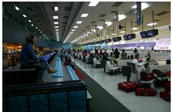
Inside the Bowling Centre