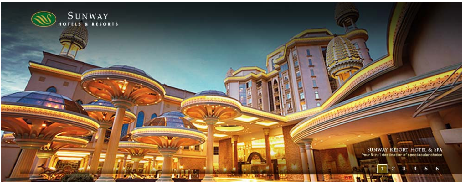
Main Entrance of the Sunway Lagoon Resort Hotel