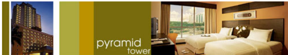
Sunway Pyramid Tower Hotel