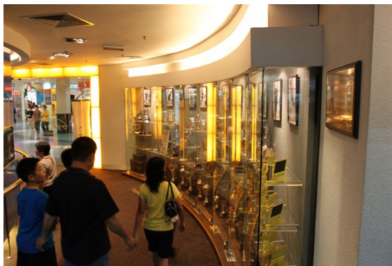
Display area near the Entrance